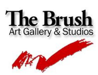
Exhibit: "Expressions of Culture and Identity" Exhibit Dates: June 10 to July 30, 2023 Reception: Saturday June 10, 2 PM